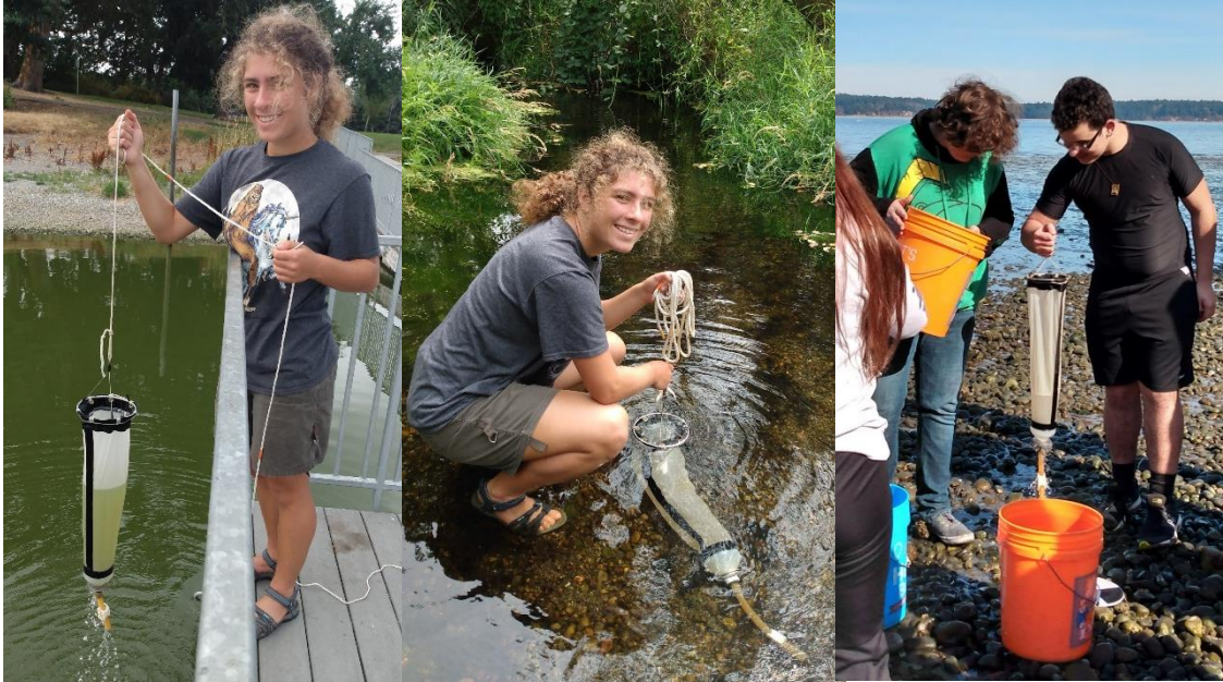
Collecting a plankton sample from a dock (left), slow-moving creek (center) and shore using a bucket (right).

After you pull up the net, hold it upright and allow the water to drain out. Place jar beneath the latex tube, open the pinch clamp, and empty the plankton sample into your jar. Remember to rinse and dry the net after each use – a sink, hose, or shower works fine!