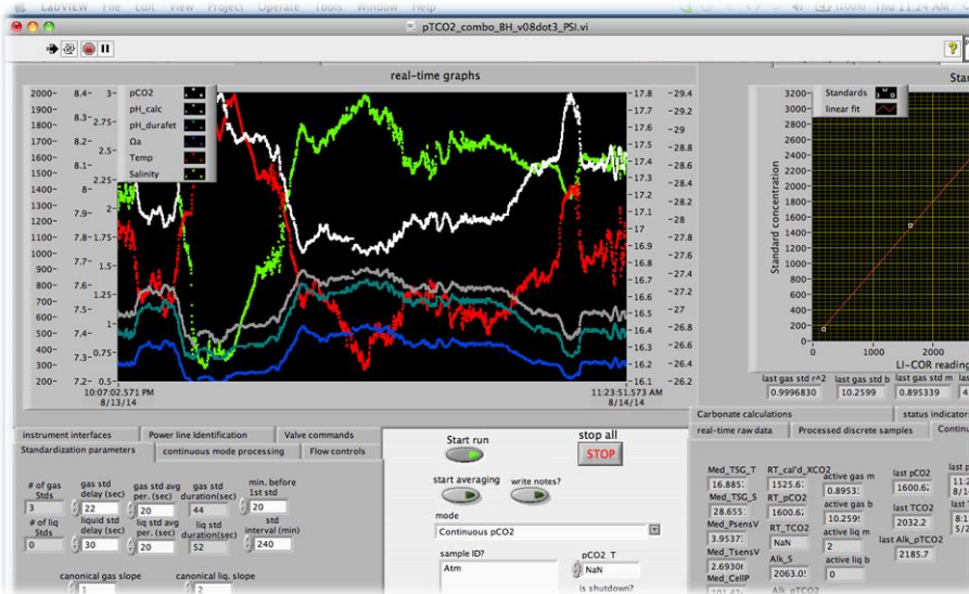
Figure 1. Real time carbon chemistry, temperature and salinity values at Bay Center.

Spencer Cove: Water quality testing has concluded for PSI at Spencer Cove, south Puget Sound. A final report to Seattle Shellfish was provided in June 2014. Over a year's worth of T, S, DO, pH, Chl, turbidity and carbon chemistry values were collected and summarized. Aragonite saturation state ( \Omega_a ) was back calculated using deployed water quality instruments and carbon chemistry spot samples. The effort provided an understanding of diel, tidal and seasonal water quality trends.