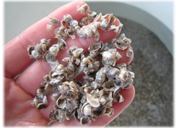
Pacific oyster seed – typically less than 6 months old.

Background: While demand for oysters is on the rise domestically and over-seas, West Coast shellfish growers are facing seed shortages due to poor growth and high mortality at supply hatcheries. Cumulative effects of changing seawater chemistry (e.g. reduced pH and elevated pCO 2 ), and the presence of other common stressors (e.g. Vibrio spp. toxins, an inadequate diet, etc.) may be reducing survivorship of Pacific oyster larvae following settlement and metamorphosis.