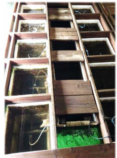
Floating Upweller System (FLUPSY) will be used to test optimum oyster seed densities, flow rates, and site requirements.

inventory and evaluate new and existing systems for remote setting and early post-set seed rearing; refine seed culture methods such as feeding tables by species and size progressions, environmental parameters and rapid on-site diagnosis. This project will conclude with a workshop for shellfish growers to communicate findings and provide technical training in seed rearing, micro-algae culturing and water quality monitoring.